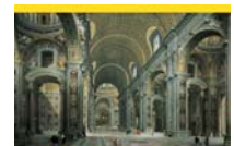
The Next Pope After Pope Benedict XVI

1968: Marxist [religion-denouncing] College uprisings across Europe result in the pope abandoning his hitherto liberal views to become a conservative Catholic.