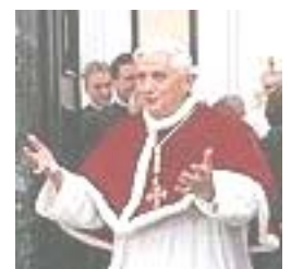
The ermine-trimmed winter mozzetta