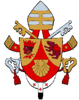
The pope's coat of arms