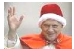
The pope with his camauro