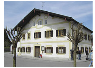
House where the pope was born in Markt am Inn